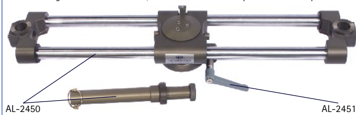
GF-Mini Bangi with standard 75cm / 2' 6" tubes and Pan adapter for Euro-adapter mounts