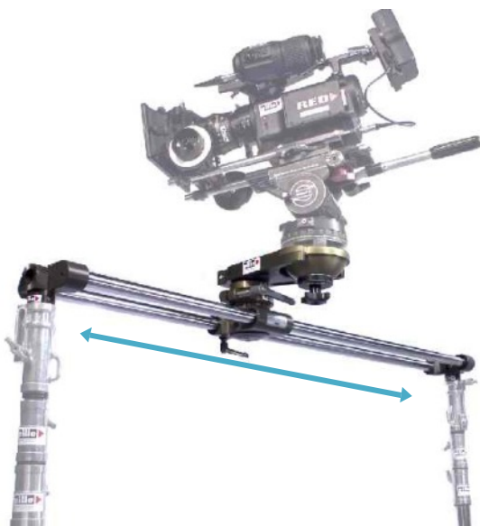
150cm / 5ft tubes, mounted on 2 lighting stands