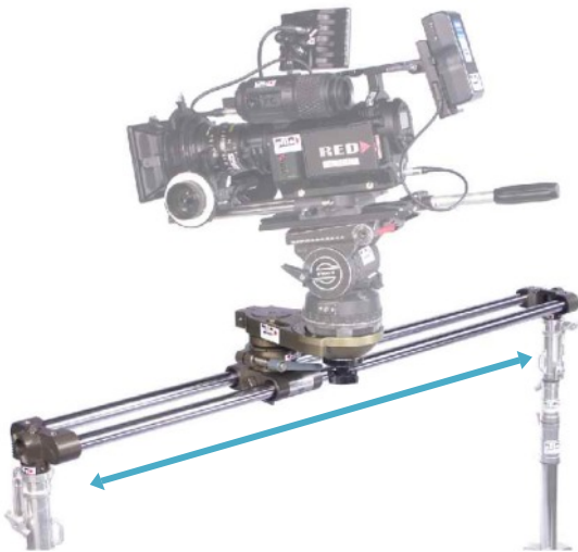
GF-Mini Bangi with 150cm / 5ft tubes, mounted on 2 lighting stands

In addition to the standard tubes, 150cm / 5' lengths are also available for longer tracking shots. The GF-Mini Bangi can be rigged in a wide manner of ways, for example between 2 lighting stands. Its light weight construction makes it ideal for use on car rigs and jib arms where it can be used to compensate for the arc of the jib arm. Other rigging adapters are also available for connecting to scaffold tubes.